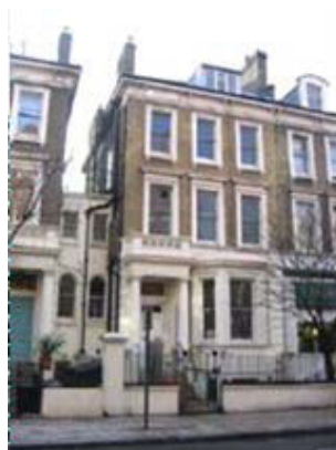
LSC Standard Student Residence (Earl's Court)