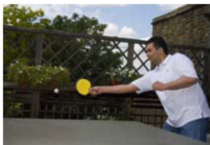
LSC table tennis competition (June 2008)