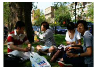
LSC students enjoying London parks (May 2008)