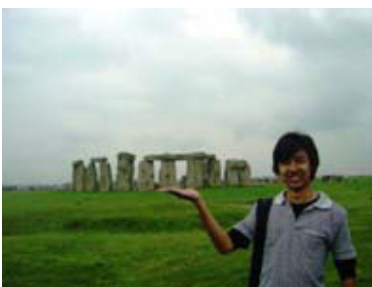
LSC Excursion to Stonehenge (May 2008)

All activities are accompanied by a trained LSC staff member